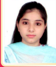
LIPSY B.Com. Sem - IV 15th Position in Uni.