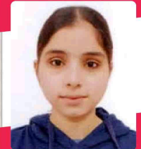
LIPSY B.Com. Sem-VI 19th Position in Uni.