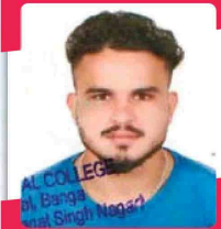
PRINCE B.A. Sem-II Inter College Winner (Captain) Senior State 2nd